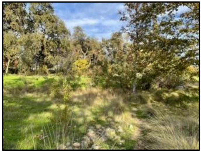
Some photos courtesy of Marc Hoshovsky.