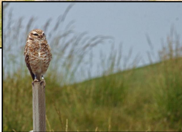
Some photos courtesy of Marc Hoshovsky.