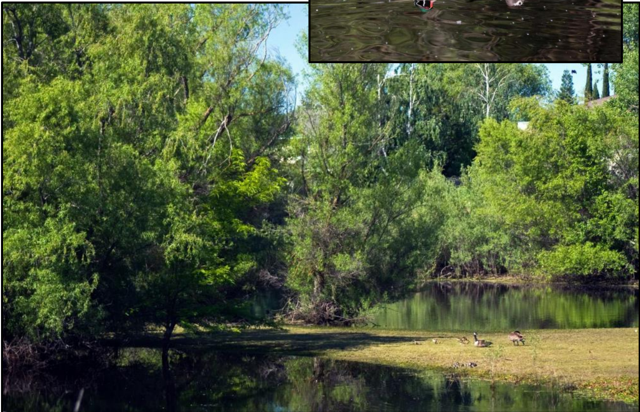
Some photos courtesy of Marc Hoshovsky.