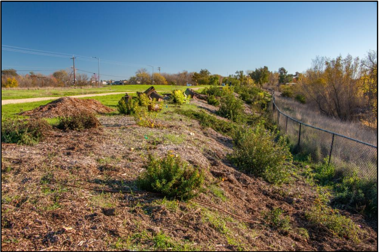
Some photos courtesy of Marc Hoshovsky.