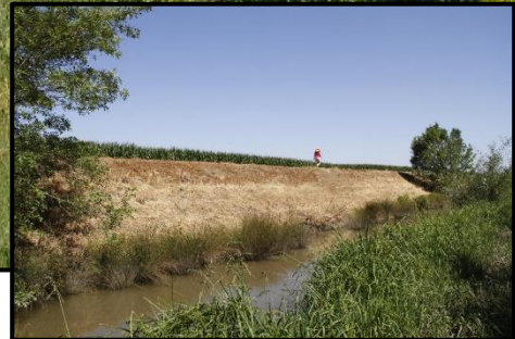
Some photos courtesy of Marc Hoshovsky.