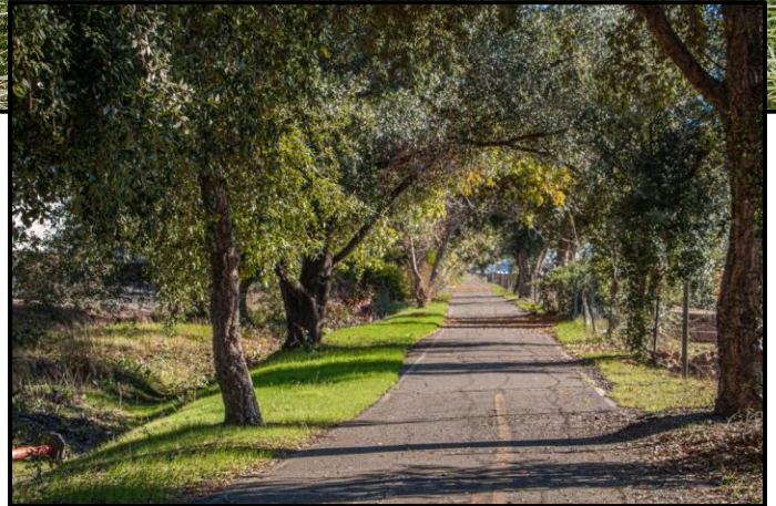
Some photos courtesy of Marc Hoshovsky.