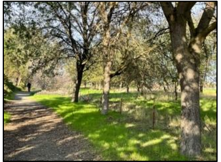
Some photos courtesy of Marc Hoshovsky.