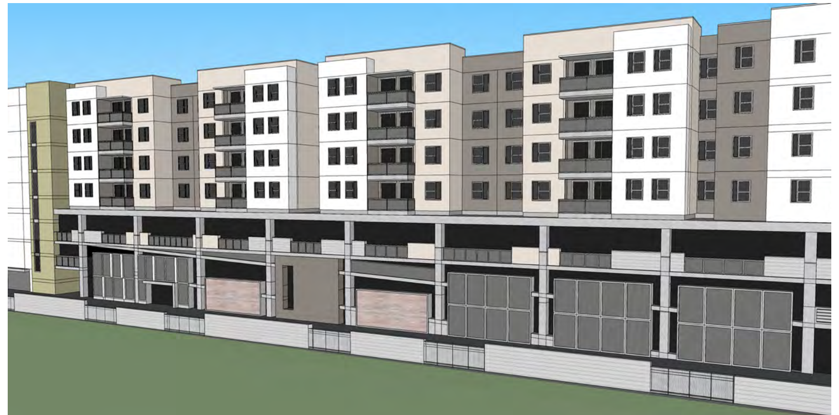
NORTH ELEVATION CONCEPTUAL BUILDING DESIGN