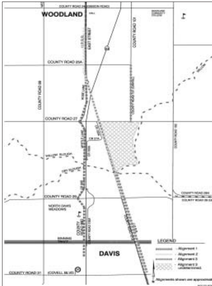
This diagram shows three corridor alignment options.