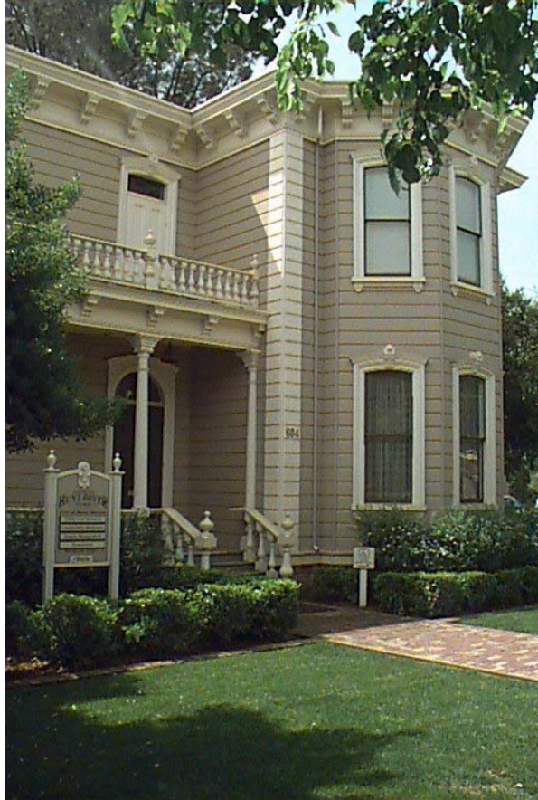
Hunt Boyer Mansion located at 604 2 nd street.