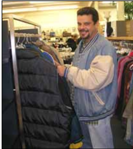
A Suit Up for Success client checks work clothes.