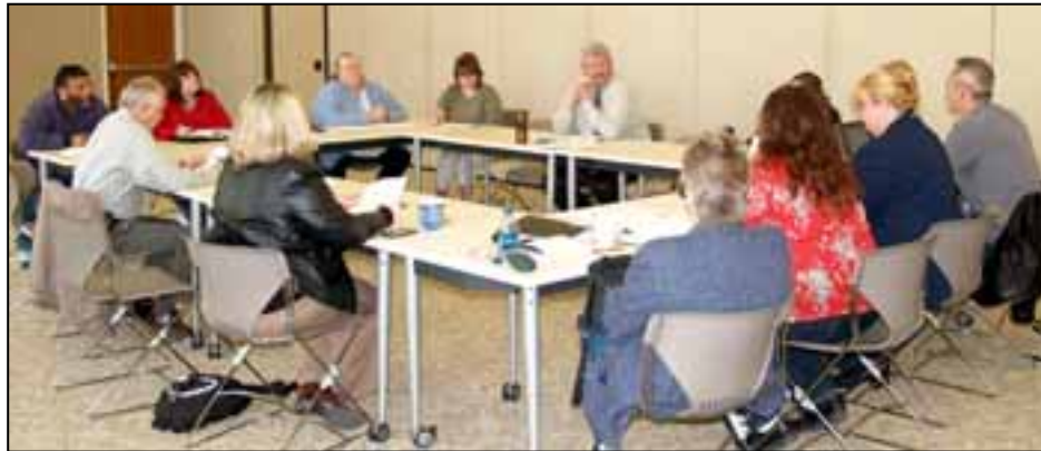
Members of the Yolo County Homeless Coalition at work.