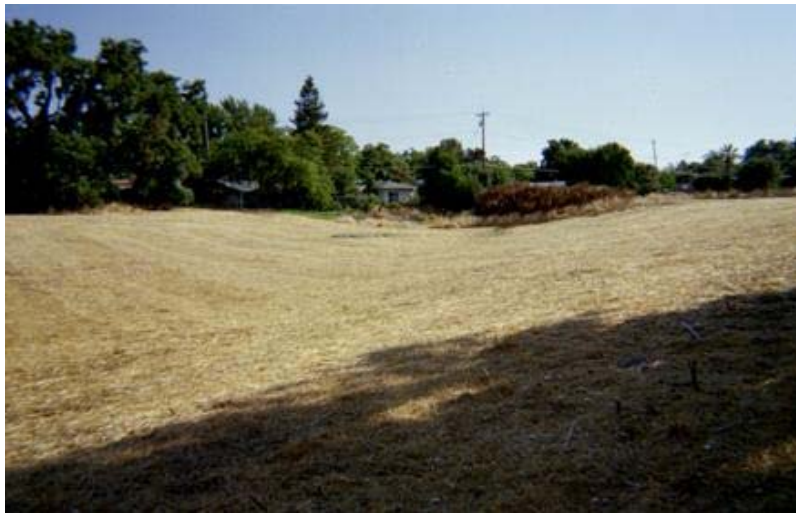
Photograph of Remnant Slough/Swale

irrigated and supports very little wetland vegetation, if any. Because the slough/swale is separated by a dirt barrier from the cemetery, there is no water flow from the cemetery into the site.