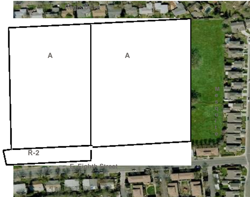
Aerial View of Chiles Ranch Property and Existing Zoning (3 parcels)

1972. The property has not been maintained or functioned as a family farm since that time. Several deteriorated outbuildings and a large barn in the southwest quadrant remain on the site. Trees and shrubs are scattered through the site, some of which are trees of significance. A large number of existing trees on site, including those in poor health, are proposed to be removed to accommodate the project. Swainson's hawks are known to nest within one-quarter mile of the proposed project and nesting has occurred on the site in the past and may support nesting in the future. Swainson's hawks, as well as other raptors, have been observed foraging on the project site. White-tailed kites roost in the cedars in the adjacent cemetery and may roost on the Simmons site. A remnant portion of an unnamed slough occurs on the south side of the eastern portion of the Davis Cemetery that cuts through the western portion of the site. The remnant slough no longer functions as a slough and functions as a dry swale.